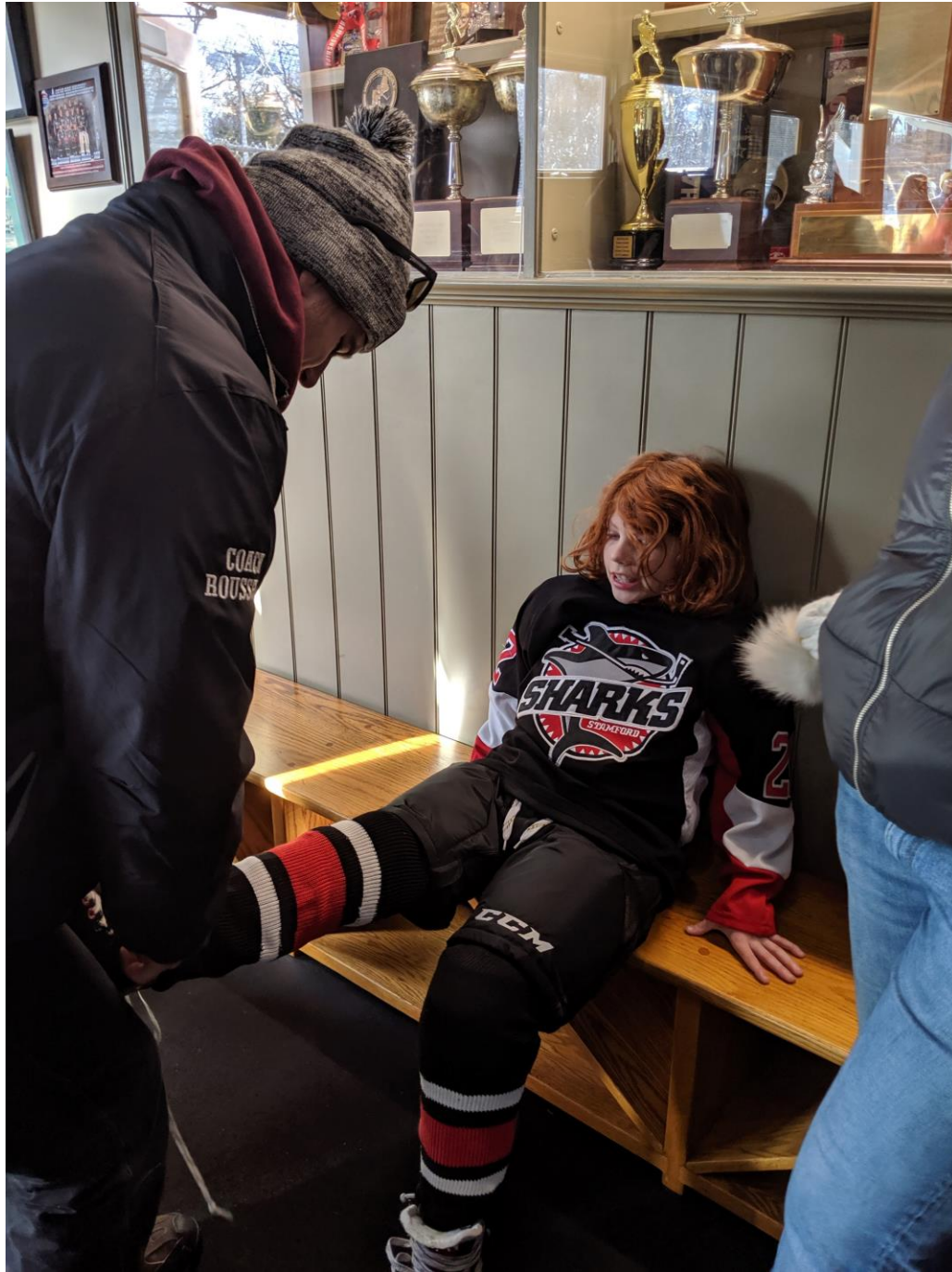
My husband (volunteer coach) tying our son's skates at an away game