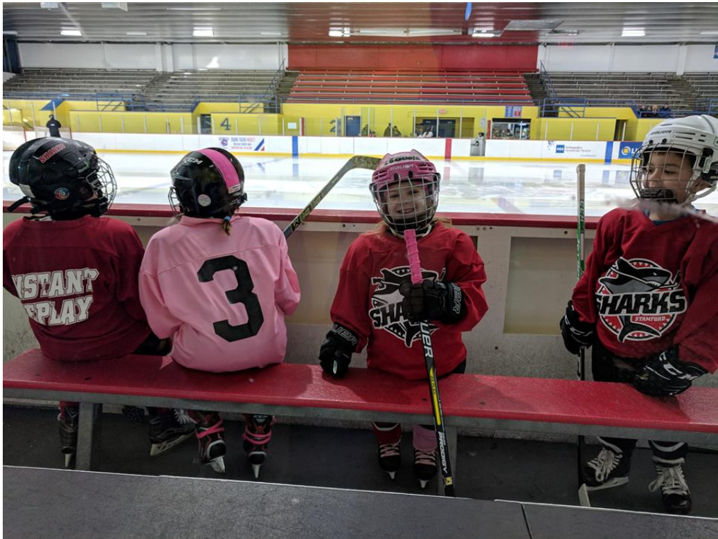
My daughter as a Tiger shark (center)