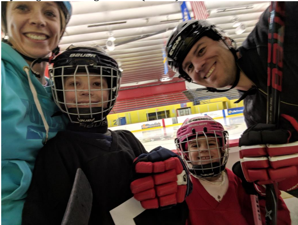
Family skate during a pre-season event at TCR