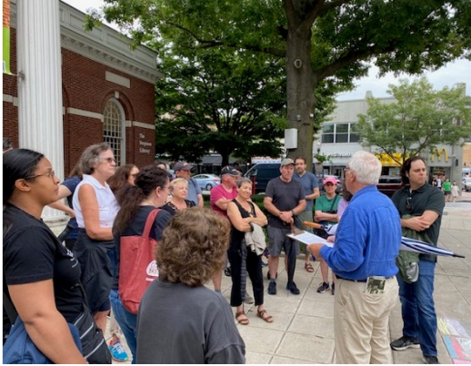
Historic walking tours