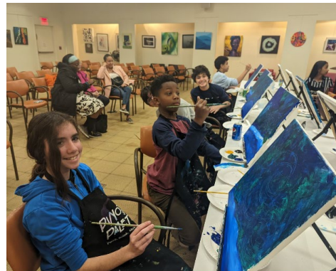
Programming is what the community wants