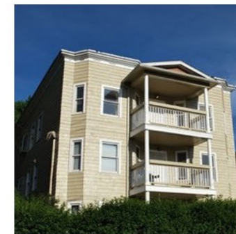
GILEAD HOUSE 16 Units/16 Beds