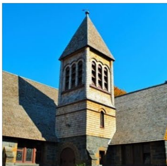
WOMEN'S HOUSING 25 Beds