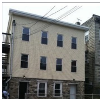
ROSE PARK APTS. 3 Units/8 Beds