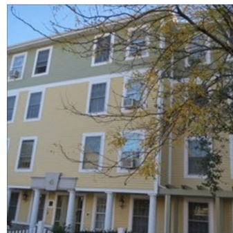
COLONY APTS. 29 Units/29 Beds