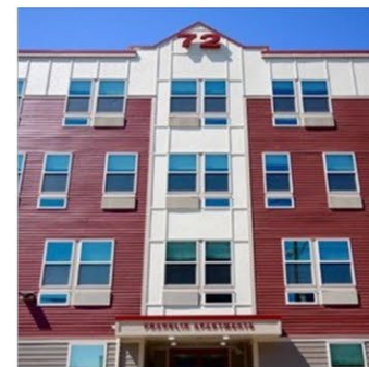
FRANKLIN APTS. 53 Units/125 Beds