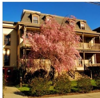
ATLANTIC PARK 27 Units/27 Beds