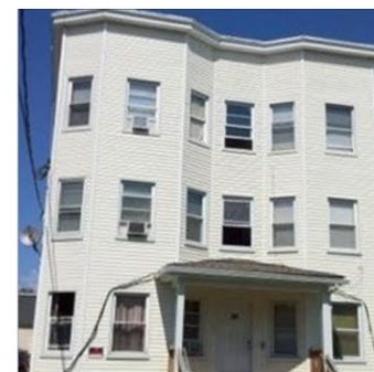
24 WOODLAND 6 Units/12 Beds