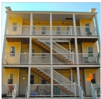
INSPIRE HOUSE 13 Units/13 Beds