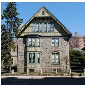
METCALF HOUSE 10 Units/10 Beds