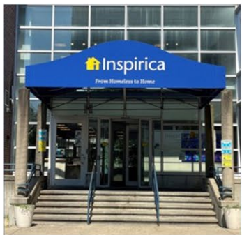
FAMILY HOUSING Emergency Housing - 42 Beds MCKINNEY HOUSE 2 Suites/15 Beds