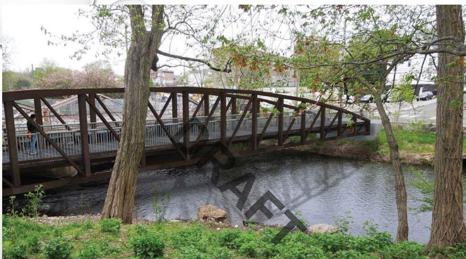
Rendering of Pre-Fabricated Pedestrian Bridge

BOR OPERATIONS COMMITTEE MEETING ON AUGUST 15, 2022 AT 6:30PM