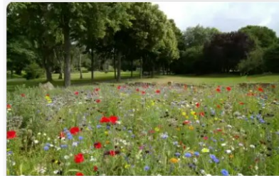
Parks and Open Spaces