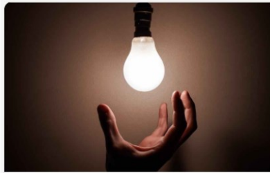
Energy Efficiency and Energy Conservation