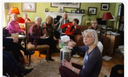
Community Outreach & Education