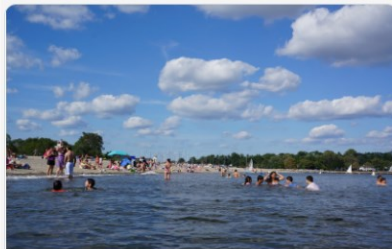
Protection of Our Beaches and Coastal Areas