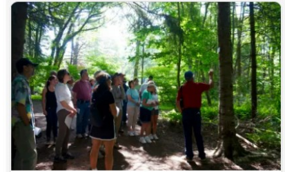
Forests and Trees