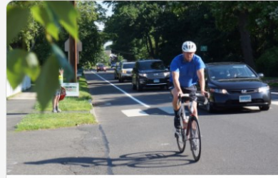
Biking and Walking