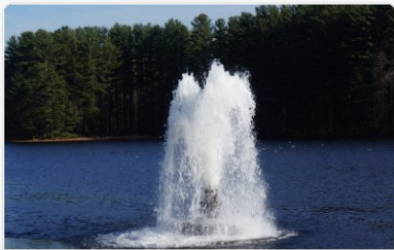
Drinking Water Supply and Quality