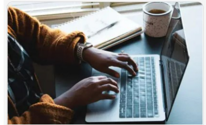
Sustainability and Town Purchasing