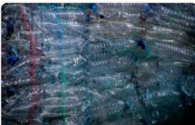
Solid Waste and Recycling