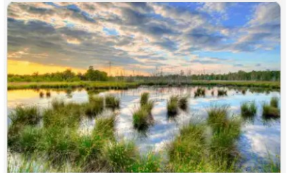
Wetlands and Marshes