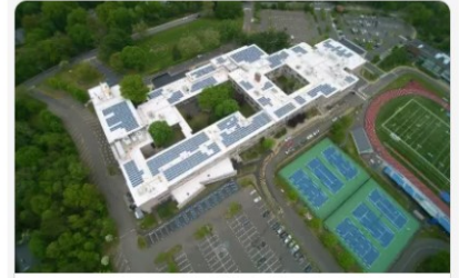
Municipal and School Buildings