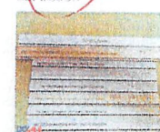
K&E Lettering Set