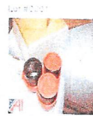
Reflectors for Distance