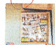
Wrico Pen Point Set