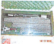
K&E Lettering System