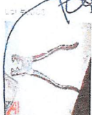
Excelet Punch Tools