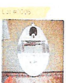
K&E Verifier Target