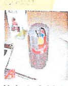
Nukote Inkjet Refill Station