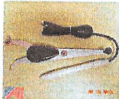
K&E Adjustable Scriber