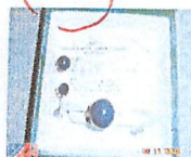
K&E Height & Slant Control