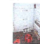
Seco Reflector and