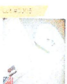
Lufkin 100' Replacements