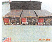
K&E Cleaning Pins & Eyelets