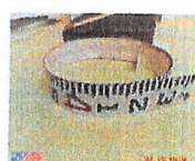
K&E Metal Replacement