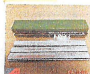
K&E Letter Guide Set