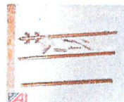
K&E Radiograph Set