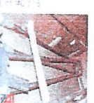
Drafting Arm in Box