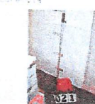
Seco Reflector and