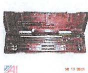
Wrico Lettering Sets