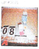
Pens Fuses and Tips