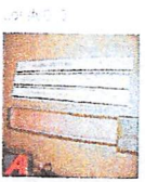
K&E Tracing Set